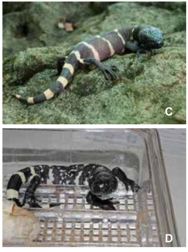
Fig. 5. A. Juvenile Heloderma horridum exasperatum (in situ, Álamos, Sonora, Mexico)..B. Neonate Heloderma h. horridum (wild-collected July 2011