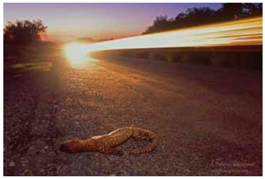
Fig. 9. A dead-on-the-road (DOR) H. exasperatum (sensu stricto) near Álamos, Sonora, Mexico. Vehicles on paved roads are an increasing threat to beaded lizards, Gila monsters, and other wildlife.

Such a conservation plan is in place for the Guatemalan beaded lizard ( H. charlesbogerti ) by CONAP-Zootropic (www.ircf.org/downloads/PCHELODERMA-2Web. pdf). Also, aspects of burgeoning human population growth must be considered, since outside of PNAs these large slow-moving lizards generally are slaughtered on sight, killed on roads by vehicles (Fig. 9), and threatened by persistent habitat destruction primarily for agriculture and cattle ranching (Fig. 10). For discussions on conservation measures in helodermatid lizards, see Sullivan et al. (2004), Beck (2005), Kwiatkowski et al. (2008), Douglas et al. (2010), Domíguez-Vega et al. (2012), and Ariano-Sánchez and Salazar (2013).