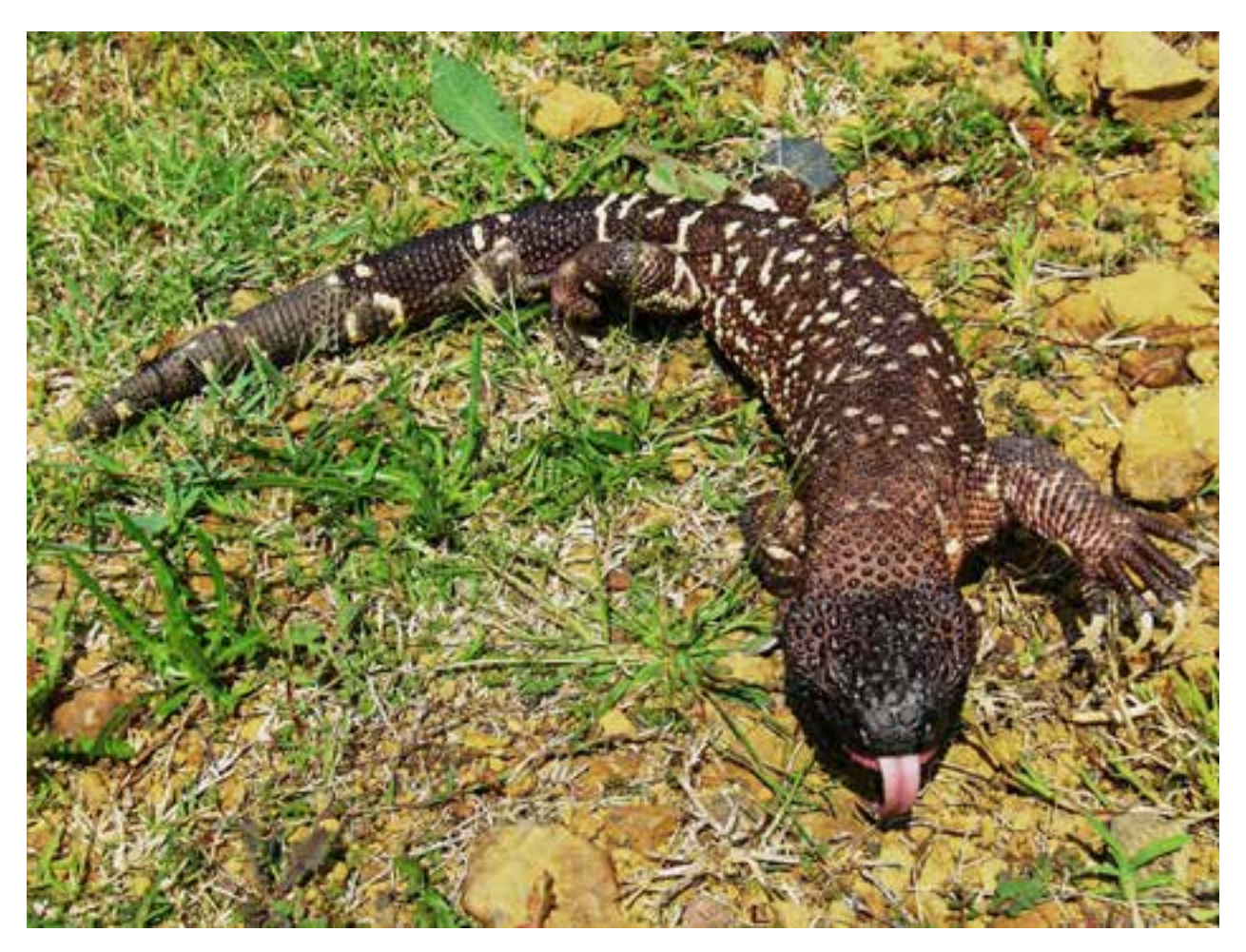
Fig. 2. Adult Mexican beaded lizard ( H. h. horridum ) observed on 11 July 2011 at Emiliano Zapata, municipality of La Huerta, coastal Jalisco, Mexico.