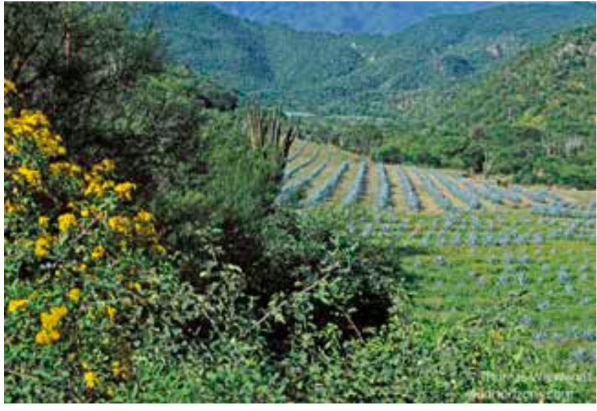
Fig. 10. Agave cultivation in Mexico results in the destruction of seasonally dry tropical forests.