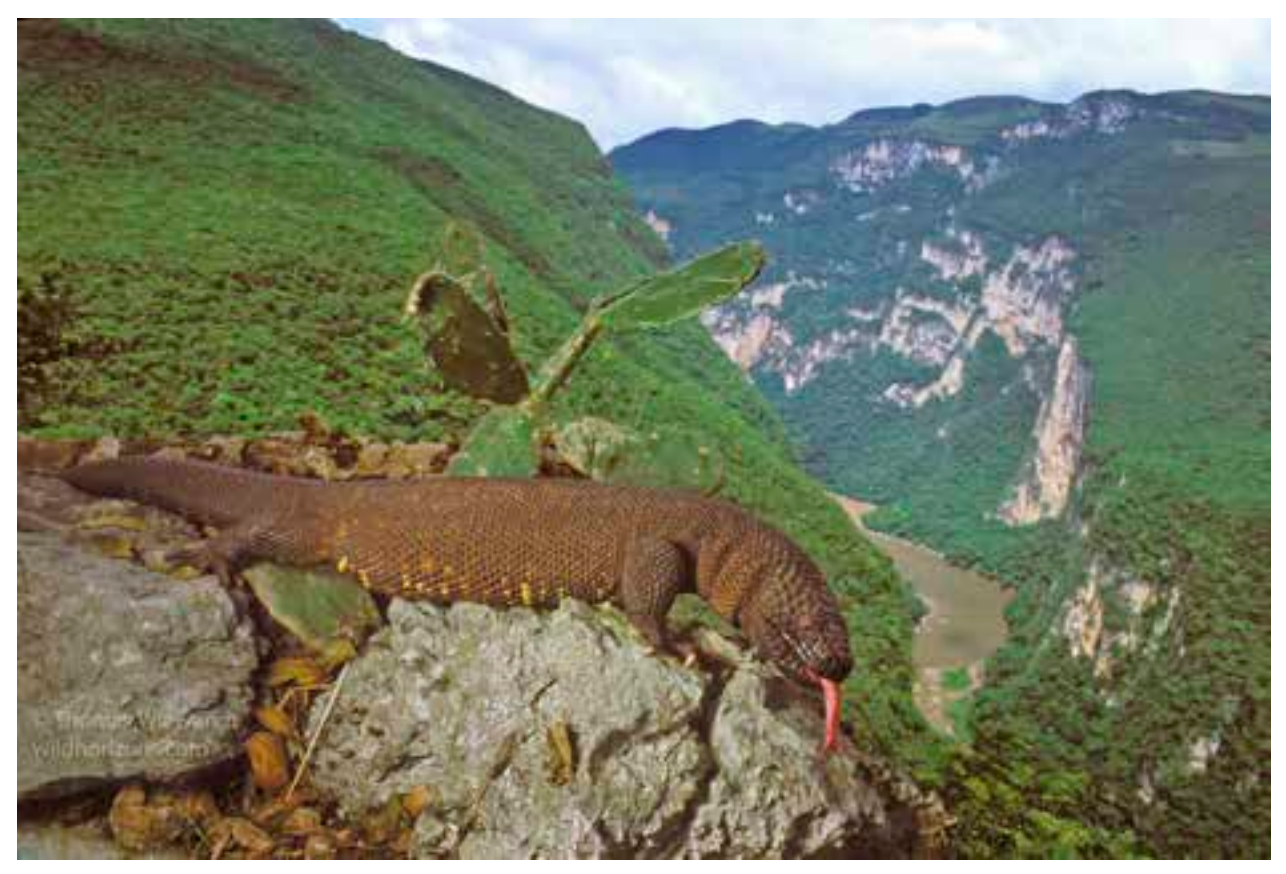
Fig. 3. Adult Chiapan beaded lizard ( Heloderma horridum alvarezi ) from Sumidero Canyon in the Río Grijalva Valley, east of Tuxtla Gutiérrez, Chiapas, Mexico.