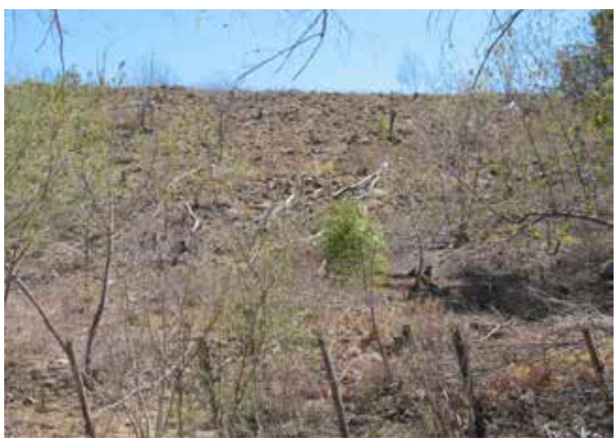
Fig. 8. Destruction of seasonally dry tropical forest near Alamos, Sonora, Mexico.

3. Conservation management plans for each of the species of beaded lizards should be developed from an integrative perspective based on modern population assessments, genetic information, and ecological (e.g., soil, precipitation, temperature) and behavioral data (e.g., social structure, mating systems, home range size).