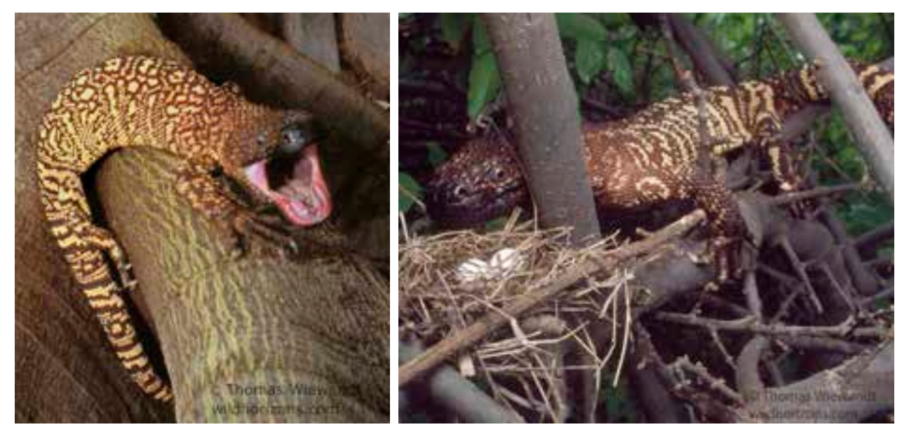
Fig. 1. A. Adult Río Fuerte beaded lizard ( Heloderma horridum exasperatum ) in a defensive display (Alamos, Sonora). B. Adult Río Fuerte beaded lizard raiding a bird nest (Alamos, Sonora).