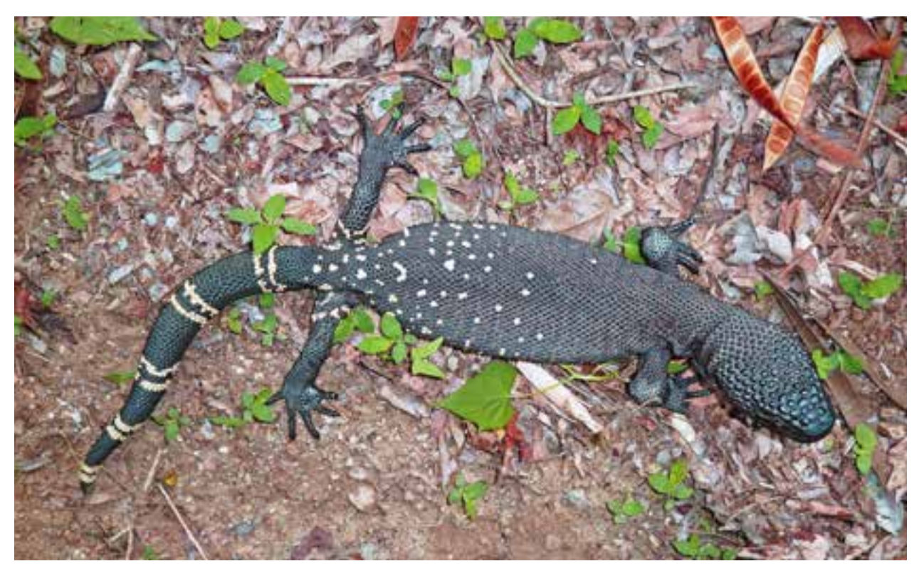
Fig. 4. Adult Guatemalan beaded lizard ( Heloderma horridum charlesbogerti ) from the Motagua Valley, Guatemala.