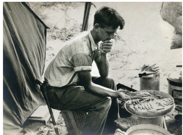
Hobart M. Smith in Mexico (1930).