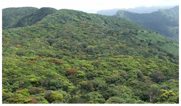
Tropical Montane Forest (>1300 m a.s.l.).