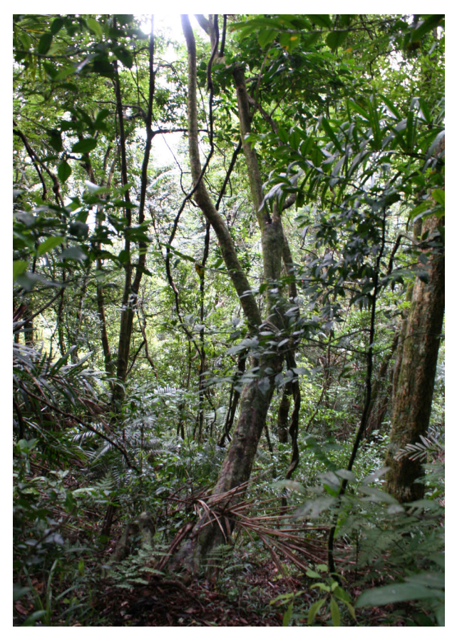
Tropical Sub-montane Forest (600-1300 m a.s.l.).