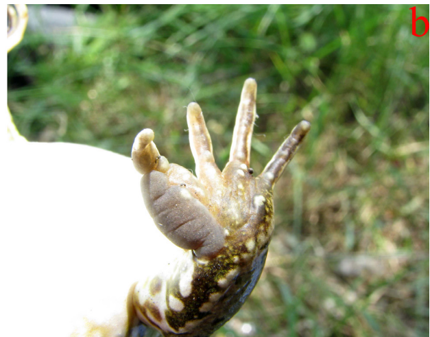
Figure 2. The presence of vocal pouches (a) and digital pads (b) in male Rana (Pelophylax) ridibunda ridibunda distinguishes them from females.