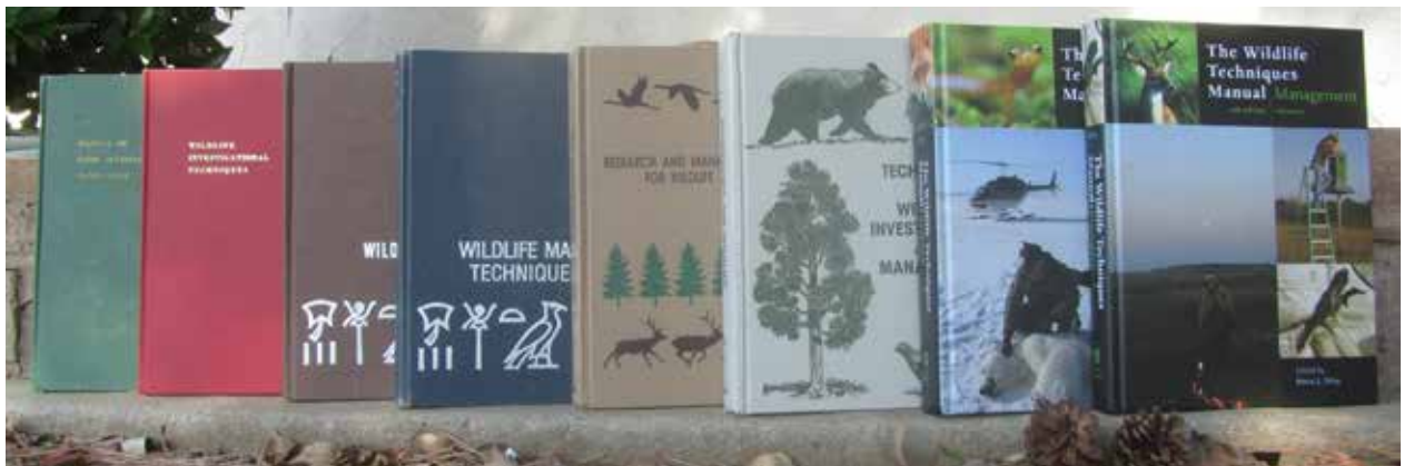
Figure 1. All editions of The Wildlife Techniques Manual , with the 7 th edition featured as two volumes (far right).

Chapter 6 is an important example of how relevant The Wildlife Techniques Manual is to current events (Sheffield 2012). At 9:45 PM, CDT, on 20 April 2010, the Deepwater Horizon offshore oil drilling rig exploded and resulted in a significant oil spill along the Gulf Coast. Chapter 6 addresses how to identify and handle contaminant-related wildlife. Various contaminants are addressed including mercury, lead, cadmium, solvents, ethylene glycol, and petroleum products. As new environmental catastrophes develop due to demands of our ever-changing world, The Wildlife Techniques Manual will be right there to provide