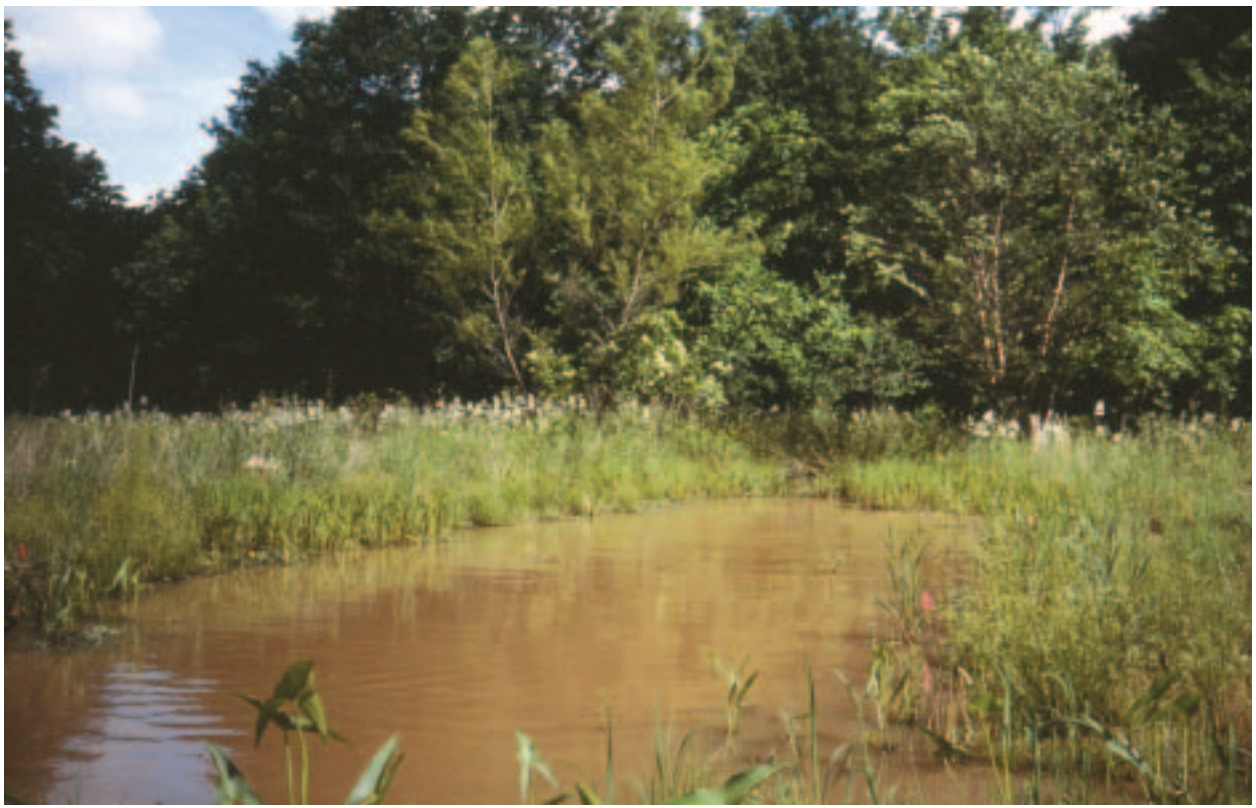
Plate 5. View of site A3 in Cherokee County, Kansas. A natural pool on the edge of a plowed crop field. DOI: 10.1514/journal.arc.0040014g006