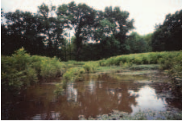
Plate 6. View of site A4 in Cherokee County, Kansas. An artificial wetland in the middle of a plowed crop field.