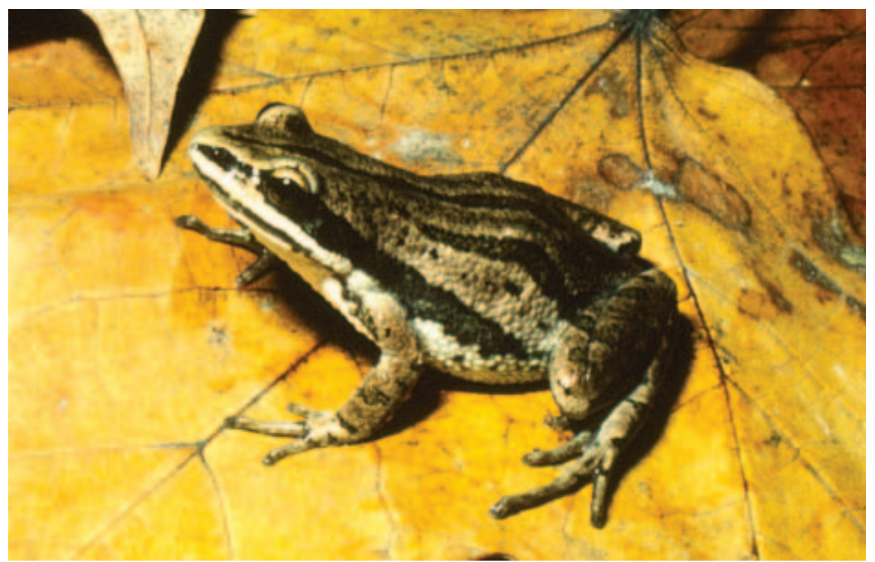
Plate 11. Western Chorus Frog, Pseudacris triseriata.