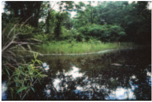
Plate 7. View of site M1 in Crawford County, Kansas. A shallow pool chiefly fed by a small ephemeral stream that originates in and runs through land that was previously mined for coal.