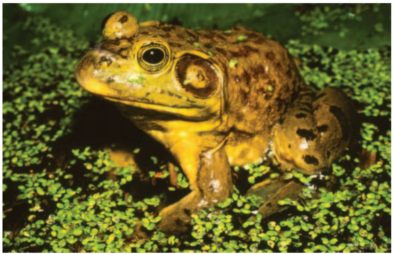
Plate 16. Bullfrog, Rana catesbeiana.