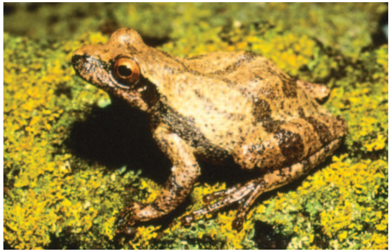
Plate 15. Spring Peeper, Pseudacris crucifer.