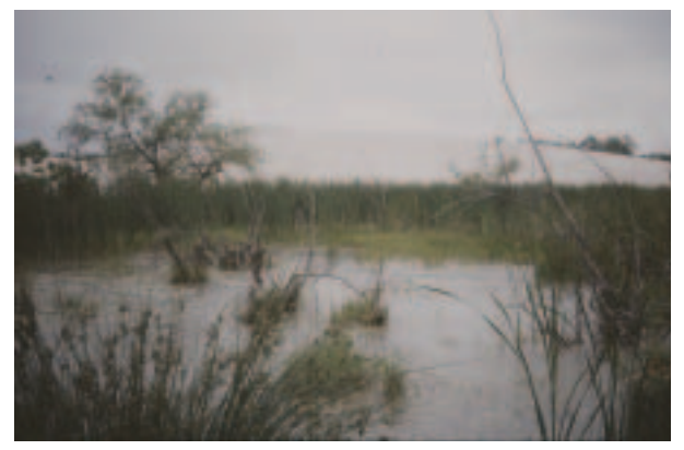
Plate 8. View of site M2 in Cherokee County, Kansas. A manmade pool at the edge of a pile of mining spoils (chat) left over from lead and zinc mining. DOI: 10.1514/journal.arc.0040014g009