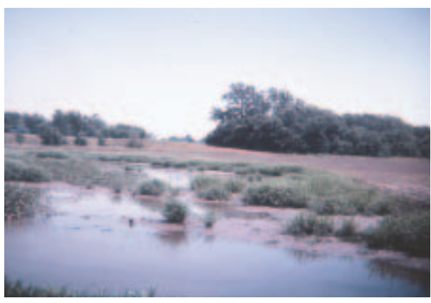
Plate 4. View of site A2 in Cherokee County, Kansas. A natural wetland surrounded on three sides by a plowed crop field. DOI: 10.1514/journal.arc.0040014g005

(Figure 1). Site selection focused on finding anuran breeding pools located in "micro-watersheds" with different immediate surrounding land uses. Three land uses were considered: agricultural, mined, and natural. Agricultural areas were plowed fields and row crops. Areas with live-