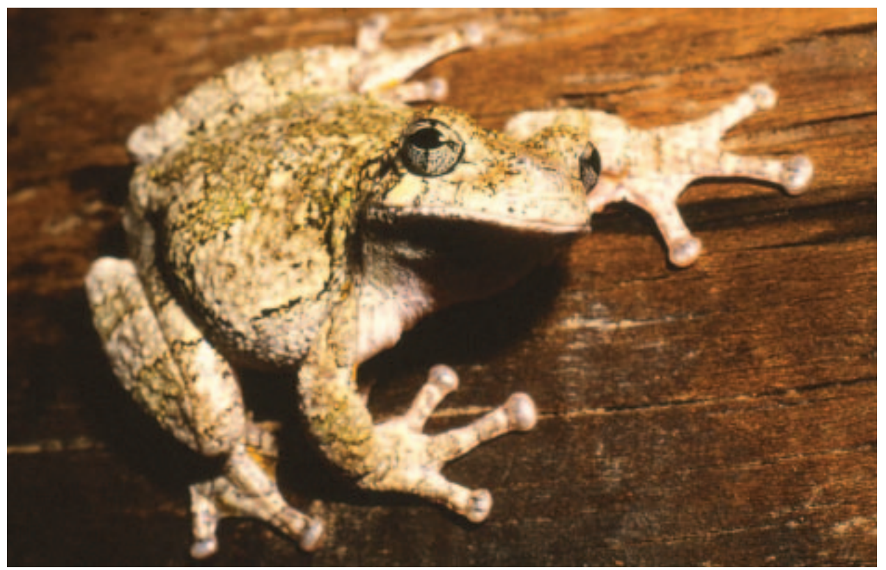
Plate 12. Gray Treefrog, Hyla versicolor/chrysoscelis.