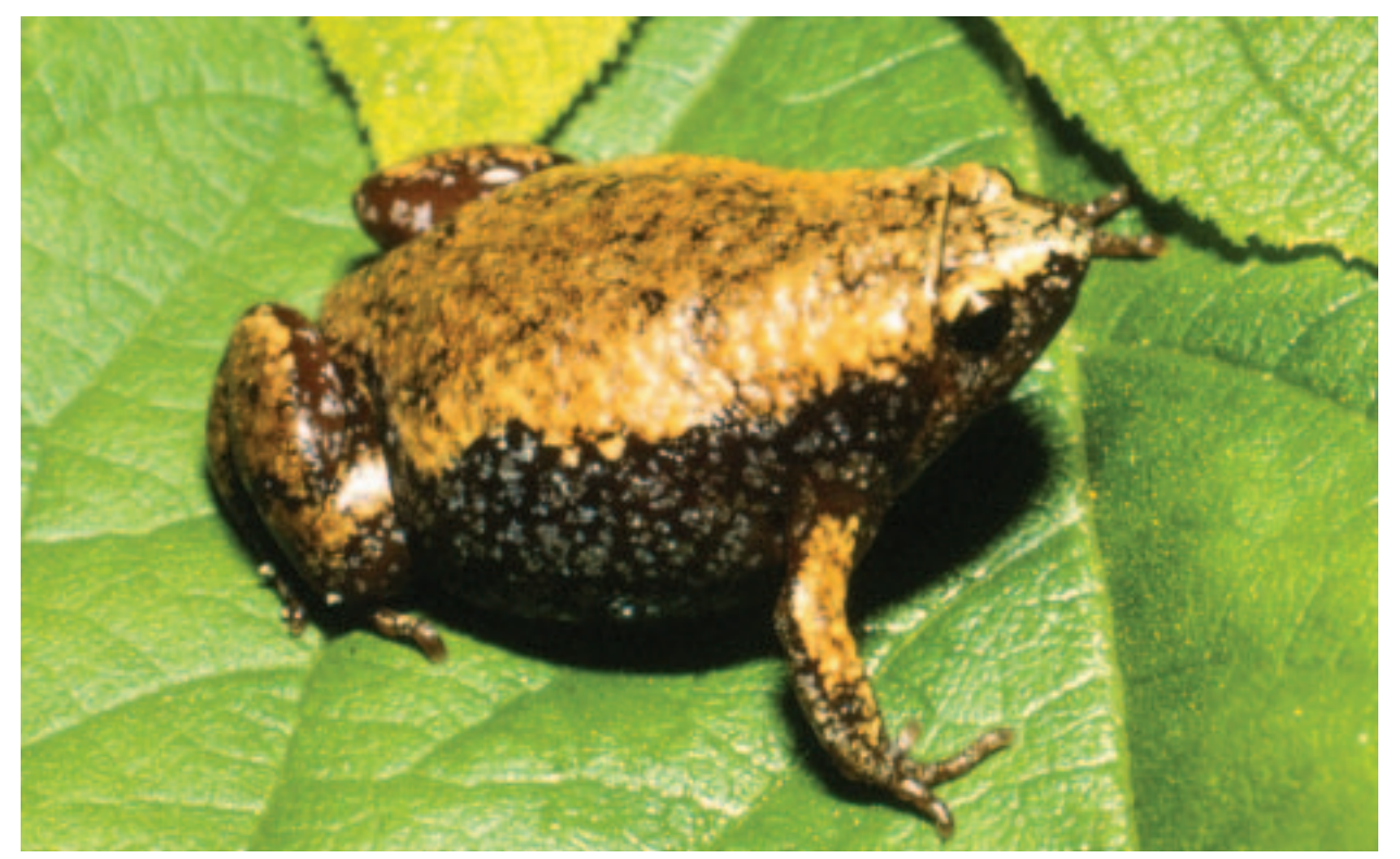
Plate 9. Eastern Narrowmouth Toad, Gastrophryne carolinensis.

Visual density of the H. versicolor/chrysoscelis complex was significantly higher in natural sites compared to agricultural sites (Table 2). The same pattern existed for audio density, but was not significant. Audio and visual density of