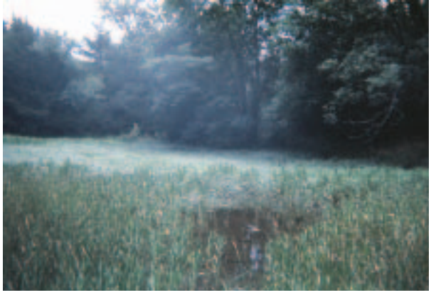
Plate 1. View of site N1 in Bourbon County, Kansas. A shallow artificial pond chiefly fed by a small ephemeral stream that originates in and runs through a meadow and a wooded area. DOI: 10.1514/journal.arc.0040014g002

ing success of eggs and the malformation rates of their hatched tadpoles incubated in the laboratory.