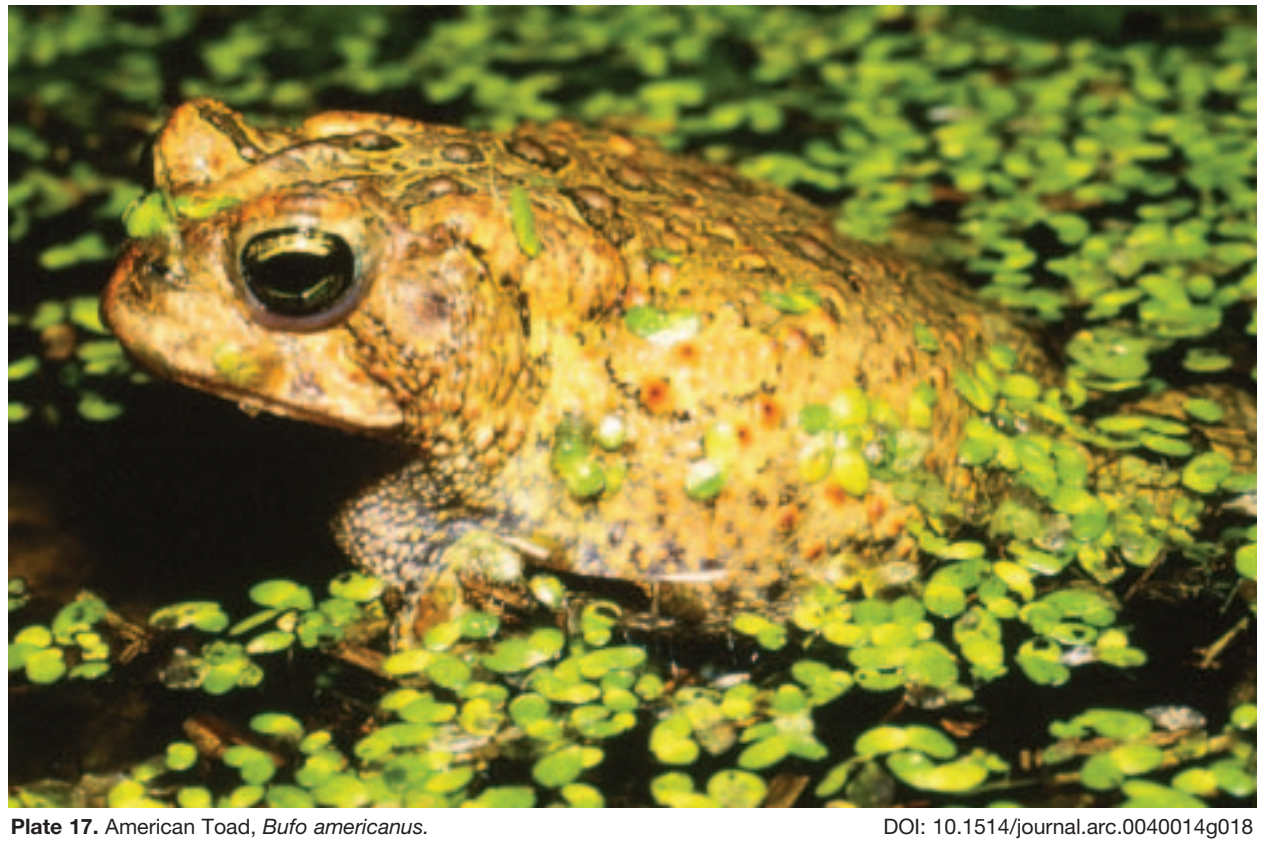
Plate 17. American Toad, Bufo americanus. D Species plates 9-17 © Suzanne L. Collins, The Center for North American Herpetology D