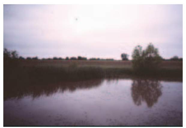
Plate 3. View of site A1 in Bourbon County, Kansas. A shallow man-made pond adjacent to a plowed crop field. DOI: 10.1514/journal.arc.0040014g004