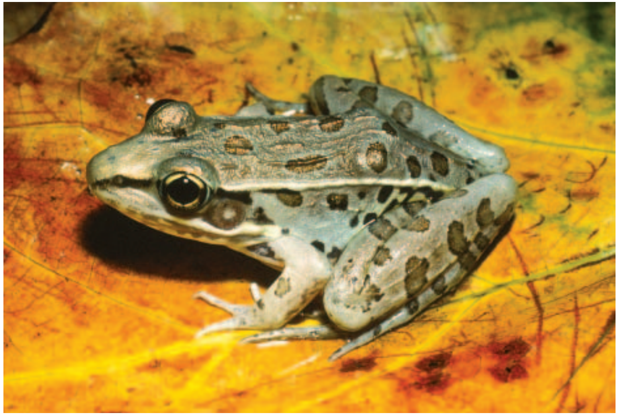
Plate 10. Southern Leopard Frog, Rana sphenocephala.