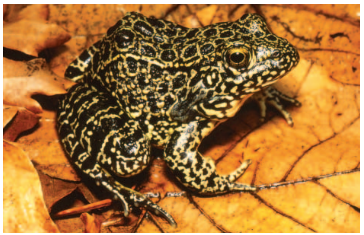
Plate 14. Crawfish Frog, Rana areolata.