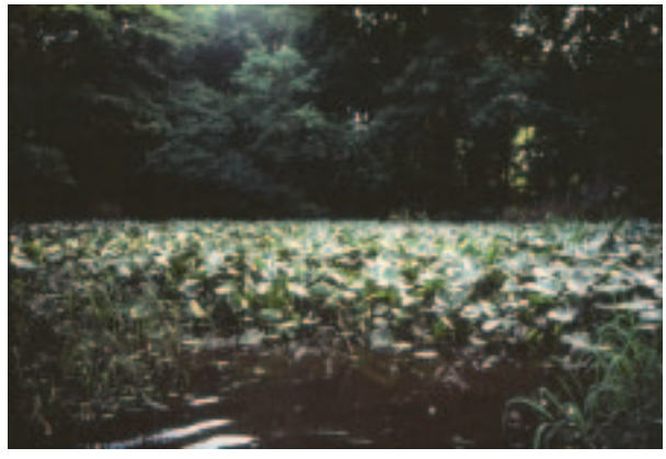
Plate 2. View of site N2 in Cherokee County, Kansas. A shallow artificial pond fed by runoff from a mature woodland area. DOI: 10.1514/journal.arc.0040014g003

The study area is located in the Osage Cuestas physiographic region in three counties in southeast Kansas USA