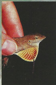
Norops tropidonotus (male), Las Cuevas, Cayo District, Belize (April 1998).

Roughgarden begins by considering how an organism such as a lizard, with its ability to make decisions regarding its choice of prey items, can maximize its rate of energy intake when constrained by food abundances, body mass, and other important aspects of lizard biology. The ability of lizards to forage profitably is related to their fitness, which in turn, can be related to the presence of other species of lizards that use similar resources. Using empirically based estimates of foraging rates Roughgarden shows that it is not unreasonable to assume that much of lizard diversity, especially on small islands, is a consequence of constraints on foraging of different-sized species as they interact together. Roughgarden sketches out a reasonable picture of how these interactions vary spatially from one island