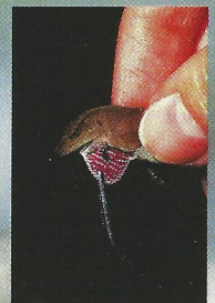
Norops uniformis (male), Cuxta Bani, upper Raspauculo, Cayo District, Belize (April 1997).