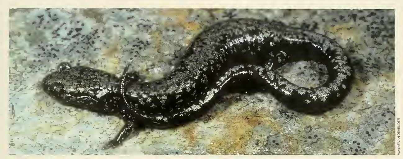
A Peaks of Otter Salamander (Plethodon hubrichti). Bedford County, Virginia.