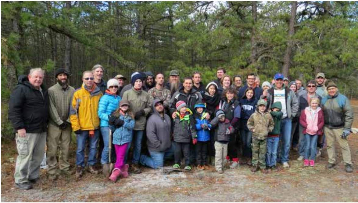
Figure 9. Sometimes many volunteers are necessary for a project, either digging up a hibernation site ( Fig 9a ), clearing open areas for sun penetration, or digging up an old septic line to prevent collapses and injuries to snakes.