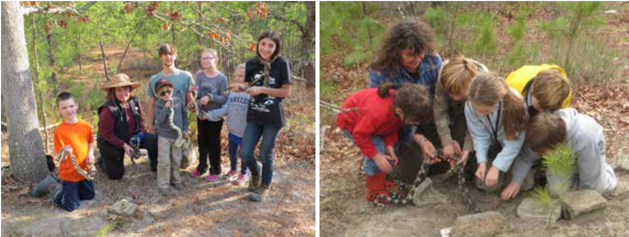
Fig. 6. Volunteers of all ages are involved in our Pine Snake research, and the handling and measuring of snakes contributes to their education, and results in their providing information about conservation to their families, friends, classmates, and others. Following hibernation studies, the children (and adults) put the snakes back into their hibernation chambers.

because the NJDEP, Endangered and Nongame Species Program has insufficient resources to gather data on all the threatened and endangered species in the state. The trend of decreasing resources may continue.