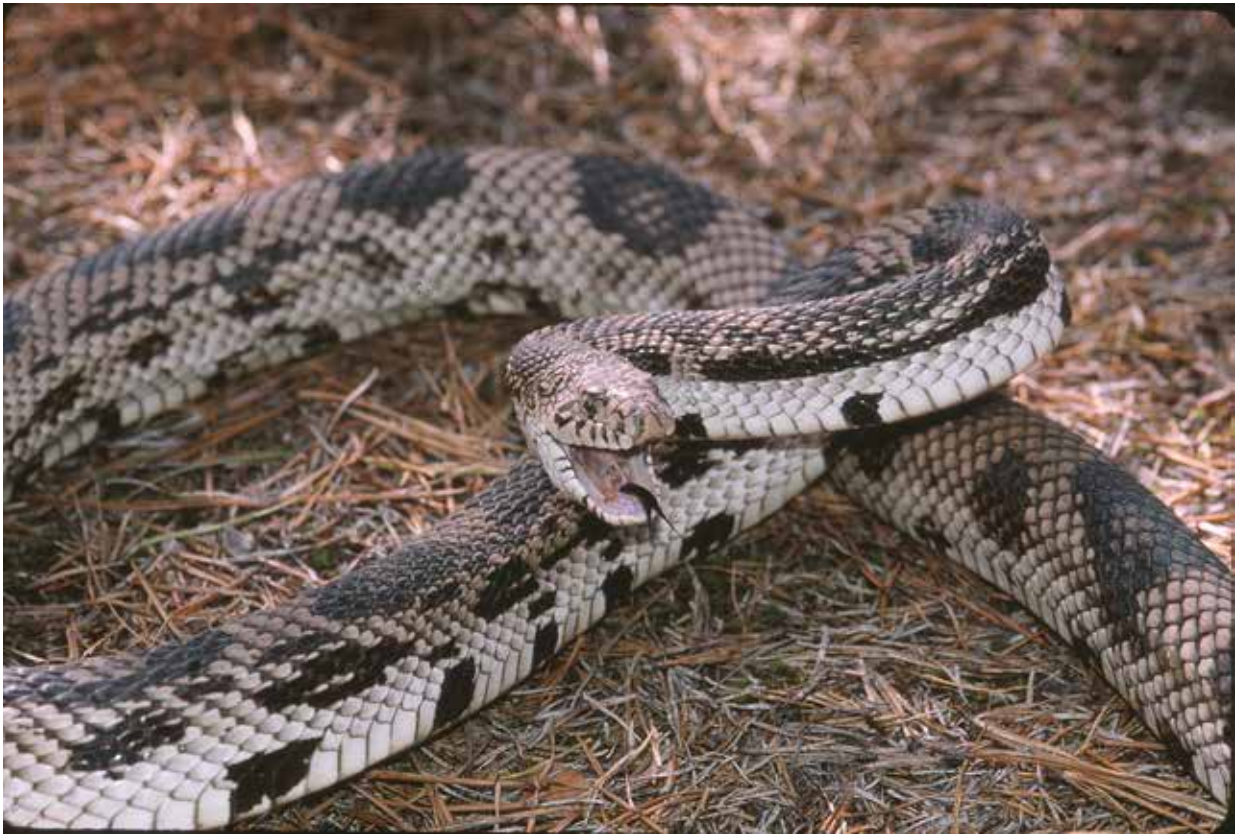
Fig. 1. Northern Pine Snake ( Pituophis melanoleucus ) hissing when first encountered in the New Jersey Pine Barrens.