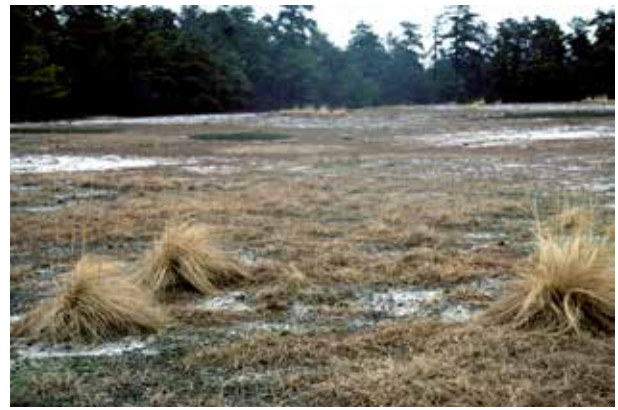
Fig. 3. Typical nesting area of Northern Pine Snakes in New Jersey. They require relatively open areas where there is complete sun penetration to the ground to provide sufficient warmth to the incubating eggs (Burger 1989a, 1991a; Burger and Zappalorti 2011a).

Background on Pine Snakes: Northern Pine Snakes are large constrictors that reach the northern limit of their range in the New Jersey Pine Barrens. They are among the top-level predators in the region and can grow to almost two meters long (Conant and Collins et al. 1998; Powell et al. 2016; Burger and Zappalorti, unpub. data). This species is declining in many parts of its range, and is not common anywhere. The declines of the species to the south, and its threatened status in New Jersey, make it imperative to understand the factors impacting population levels. The New Jersey population of Northern Pine Snakes is isolated from other populations living to the south by several hundred km (Burger and Zappalorti 2011a, 2016; Powell et al. 2016).