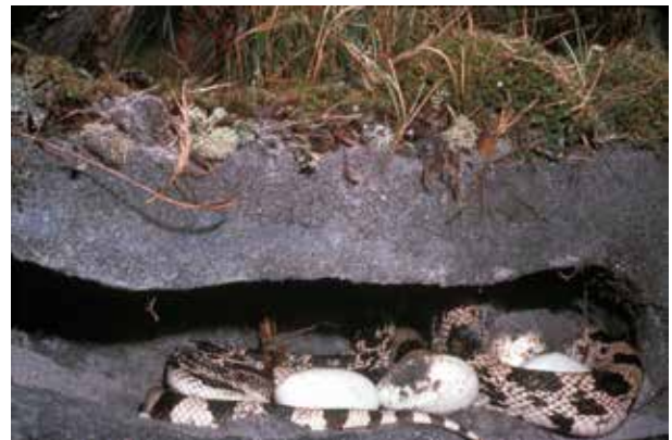
Fig. 4. Female Pine Snakes sometimes remain in their nests for several days after egg-laying is complete, perhaps protecting their clutch from being disrupted by other females that lay in the same nest.

Pine Snakes in the New Jersey Pine Barrens are the only North American snake that excavates their own nest in open-canopy sandy areas, and show high fidelity to these exact nest sites (Burger and Zappalorti 1991, Fig. 2). Open sandy areas with appropriate ground vegetation to provide structure to support excavation, while maintaining sun penetration to the ground, are rare in the Pine Barrens. Usually several females nest in the same open clearing (Fig. 3), and sometimes several females lay eggs in the same nest (Burger and Zappalorti 1991, 1992). The nest tunnel can be more than two meters long. Clutches can be distinguished because females exude a substance that binds the eggs together. Excavation of nests can take several days, and digging females usually rest during the hottest part of the day in the shade of pine trees. Once part of the tunnel is excavated, females sometimes remain in the tunnel during the heat of the day, and continue to do so for a few days after a clutch is laid (Fig. 4). Nesting females and their nests are vulnerable to off-road vehicles (ORVs), poachers, and predators, as are hatchlings (Burger 2006, 2007, Burger et al. 1992, 2007;