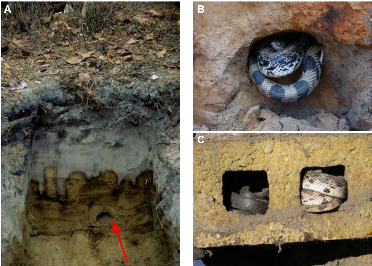
Fig. 5. Pine Snakes hibernate in communal hibernacula that can contain up to 30 or more Pine Snakes (Burger et al. 1988; Burger and Zappalorti 2011a, b, 2015, 2016). Fig. 5a shows the depth hibernation chambers are below ground, a snake in a natural chamber ( Fig 5b ) and in cement blocks from an old septic chamber ( Fig. 5c , Pine Snake on right, Black Racer on left).

Burger and Zappalorti 2016). Northern Pine Snakes from the New Jersey Pine Barrens are highly prized by collectors because of their vibrant black and white pattern.