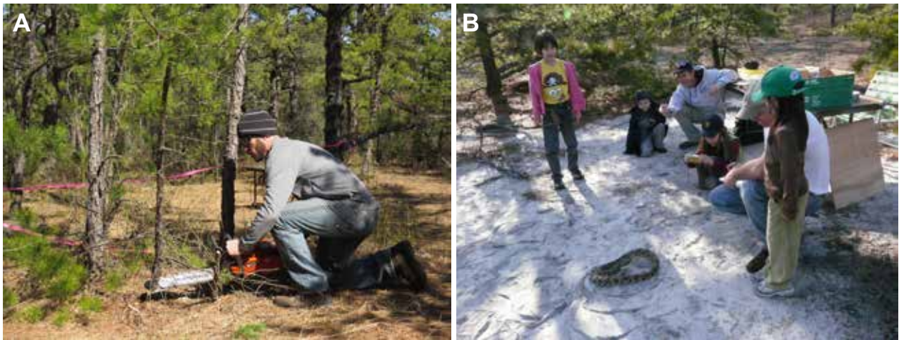
Fig. 7. Volunteers contribute directly to conservation efforts by helping to remove trees that are obstructing sun penetration to nests or hibernation sites ( Fig. 7a ), or taking data on snake behavior ( Fig. 7b ).

have shed (and we remain until they have emerged, dispersed, and are no longer visible; Fig. 8).